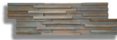
(RL-007) GREY WASHED RIPPLE