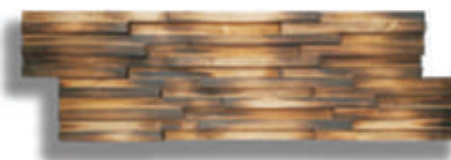
(RL-002) RUSTIC RIPPLE