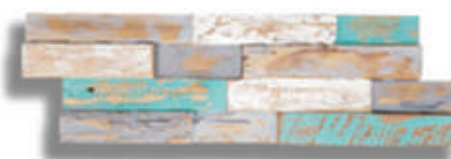
(RB-002) NAVY RAINBOW