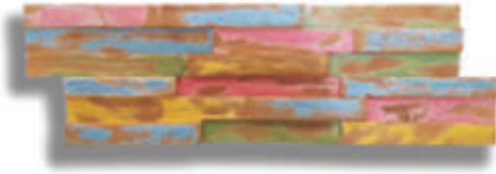
(RB-003) COLORFUL RAINBOW