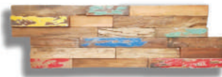
(CR-005) VINTAGE CORAL