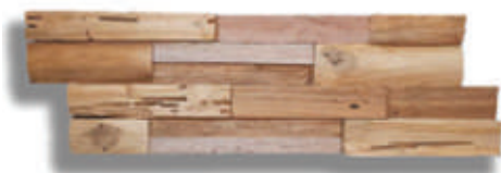
(CR-007) BIG CORAL

PRICE INCLUDED GST SPECIAL WHILE STOCK LAST LMT: LINEAR METTER PRICE CORRECT AS AT 17-02-2021