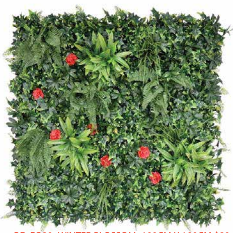
OD-FO20 -WINTER BLOSSOM -100CM X 100CM $80