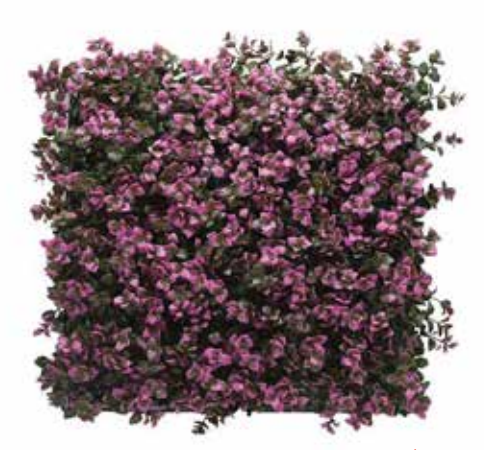
OD-AO74V204-BLOOMING SQUARE-100CM X 100CM $250