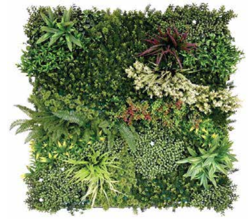
OD-KOO3A-SPRING MEADOW- 100MMX100MM $95