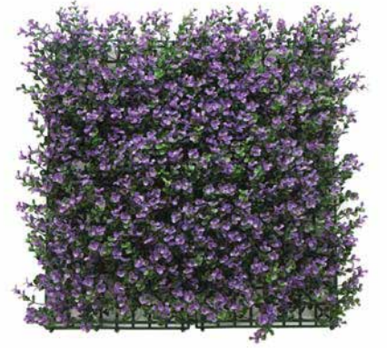
SHADOW WALL OD011- 50X50CM $15