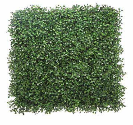
OD-A0001 -EVERSOFT GREEN 50CM X 50CM $15