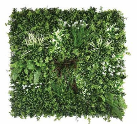
OD-FOO1 -WHITE SUMMER-100CM X 100CM $95