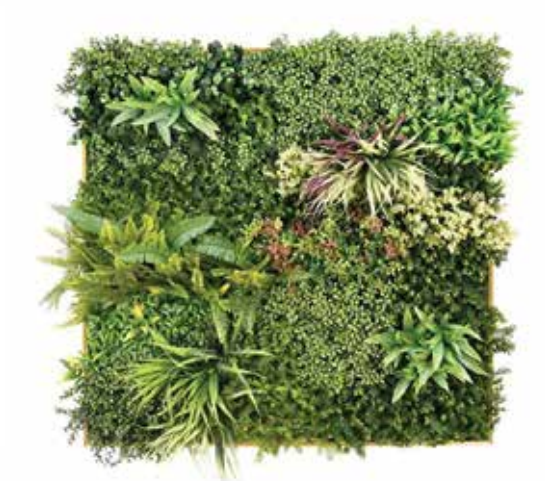
OD-AO74V204-BLOOMING SQUARE-100CM X 100CM $250