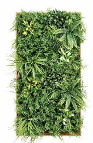
OD-AO100H010-ALLGREEN REGULA-50C X 100CM $130