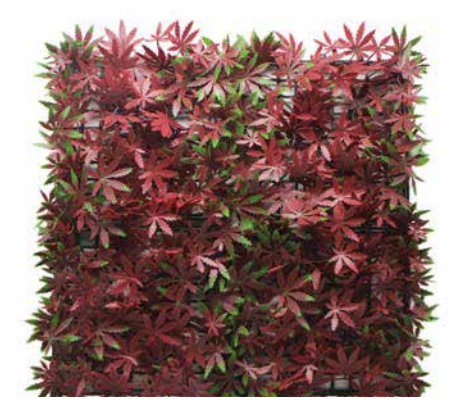
COZY AUTUMN OD A007- 50X50CM $15