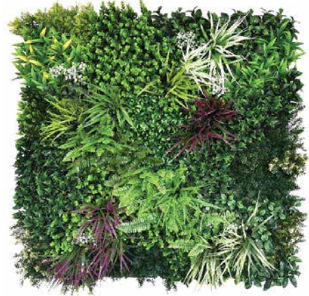
OD-AO148- ELEGANT SPRING- 100CM X 100CM $95