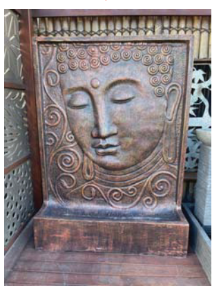
PYRAMID W/F, PUMP, H=1.25M $1,250.00 WAVE W/F, PUMP, H=1.65M $950.00 FEAFY W/F, PUMP, H=1.70M $1,550.00 BUDDHA FACE W/F, PUMP, H=1.55M $1,250.0