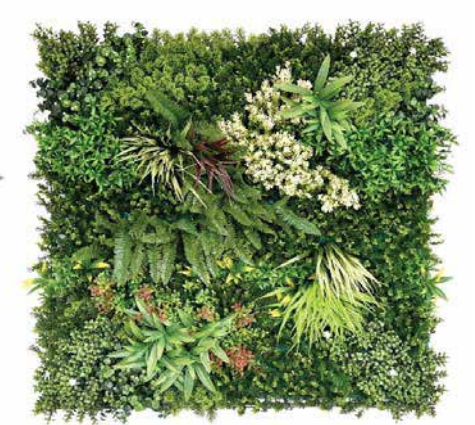
DD-ROOSC- SPRING MEADOW-TOOMINIX TOOMIN $95