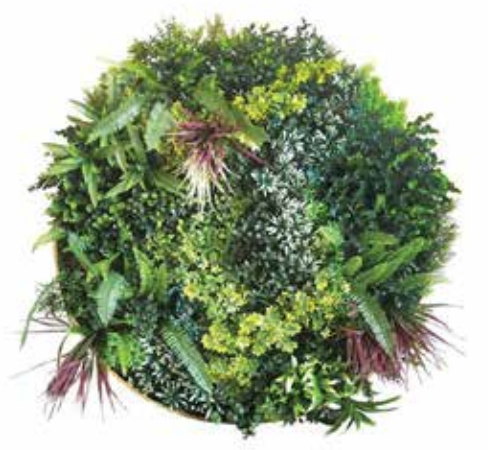
OD-FO31VO33- JOYFULL SPHERE-DIA 100CM $250