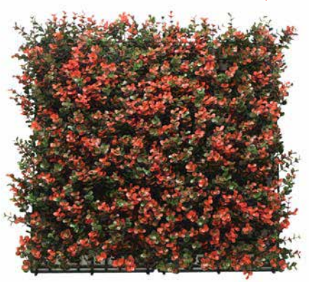
LUCKY STYLE OD A013-50X50CM.JPG $15