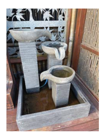
ZEN CIRCA W/F H=1.5M, PUMP $1,250.00 ECLIPSE W/F, H= 1.6M, PUMP $1,250.00 STRING WF, H=1.5M, PUMP $1,250.00 TRIO BOWL W/F, H= 90CM $950.00/EA