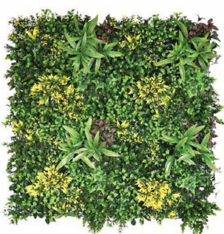
OD-AO136-TROPICAL IOV- 100CM X 100CM $80