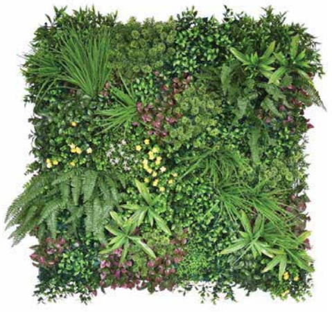
OD-FOO6- MAGIC AUTUMN- 100CM X 100CM $95