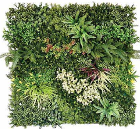
DD-KOO3B-SPRING MEADOW- 100MMX100MM $95