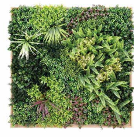
OD-KOO1BVO14 -EVERLASTING SQUARE-100CMX100CM $250