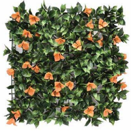
OD-AO211-BOUGAINVELLIA- 50CM X 50CM $15