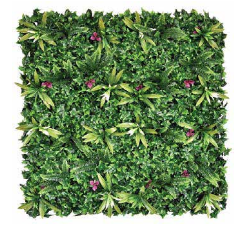
OD-AO133S -ELEGANT FOREST-100CM X 100CM $80