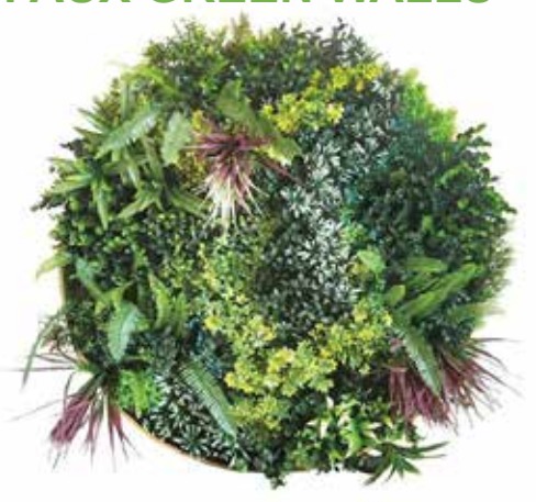
OD-KOO3CV031-BLOOMING SPHERE-DIA 100CM $250 OD-FOO6VO31-WONDERLAND SPHERE-DIA 100CM $250