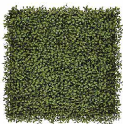
D-A0019-WINTER GREEN SOCM Y SOCM $15